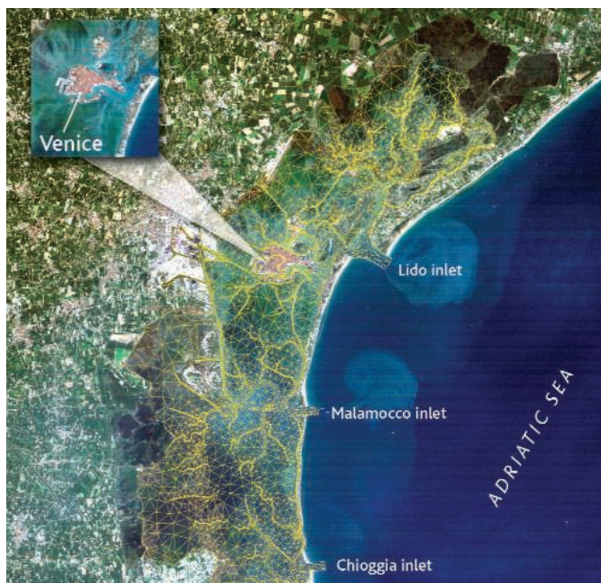
Complex interactions. A computer model, overlaid on a satellite image, divides the Venice Lagoon into thousands of interacting triangles to enable study of its processes, such as water flow and sediment transport.

For instance, Venice’s record of sea-level change is now the most comprehensive in the world. Modern records of watermarks go back to the late 19th century, and researchers are finding ways to push the data farther back in time. A Venetian tradition of painting scenes with the help of camera obscura projections, the pinhole predecessor to photography, has left researchers with accurately scaled images of the green algae lines