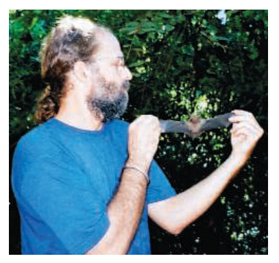
Biological riches. Steven Goodman holds newly discovered bat species of Madagascar.

economic downturn hit Madagascar, says Goodman. "There were a lot of people with little to no means to feed their families, tourism was close to zero, and organized crime had notably grown," he says. Some of Ravalomanana's decisions came under harsh criticism, such as his leasing of half of Madagascar's arable land to