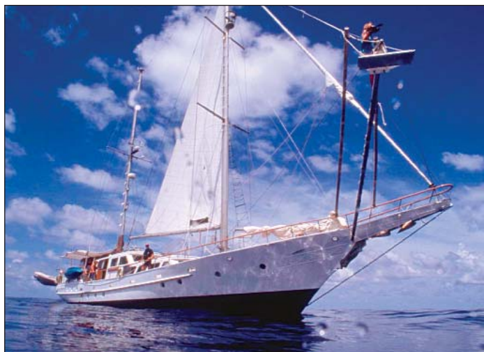
No ordinary whaler. The Odyssey is in the last year of a 5-year voyage to measure persistent organic pollutants in sperm whale blubber.