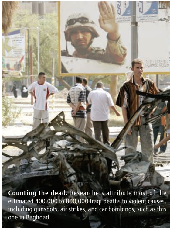
Counting the dead. Researchers attribute most of the estimated 400,000 to 800,000 Iraqi deaths to violent causes, including gunshots, air strikes, and car bombings, such as this one in Baghdad.

The Lancet study, designed by researchers at Johns Hopkins University in Baltimore, Maryland, is based on a survey conducted between May and July by a team of 10 Iraqi health workers. (The Johns Hopkins researchers met with the Iraqi team twice across the border in Jordan to advise on the survey techniques.) The team visited