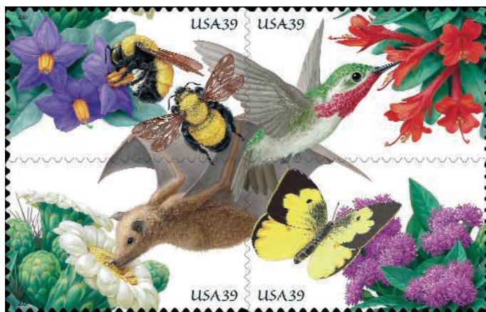
Stamps of approval. Next spring, the U.S. Post Office will issue these and other stamps depicting pollinators.

seeds, and nuts—that rely on animal pollinators, which include beetles, butterflies, flies, bats, hummingbirds, and bumblebees. But the king of pollinators is Apis mellifera , the European honeybee. Much preferred over its African cousin, it’s a “generalist” that pollinates a huge variety of crops. It is also highly social and thus easy to muster.