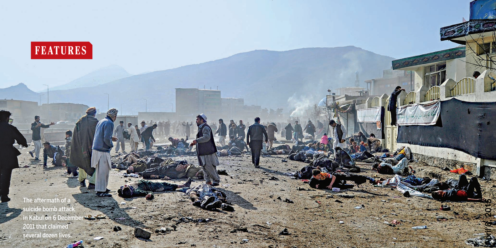
The aftermath of a suicide bomb attack in Kabul on 6 December 2011 that claimed several dozen lives.